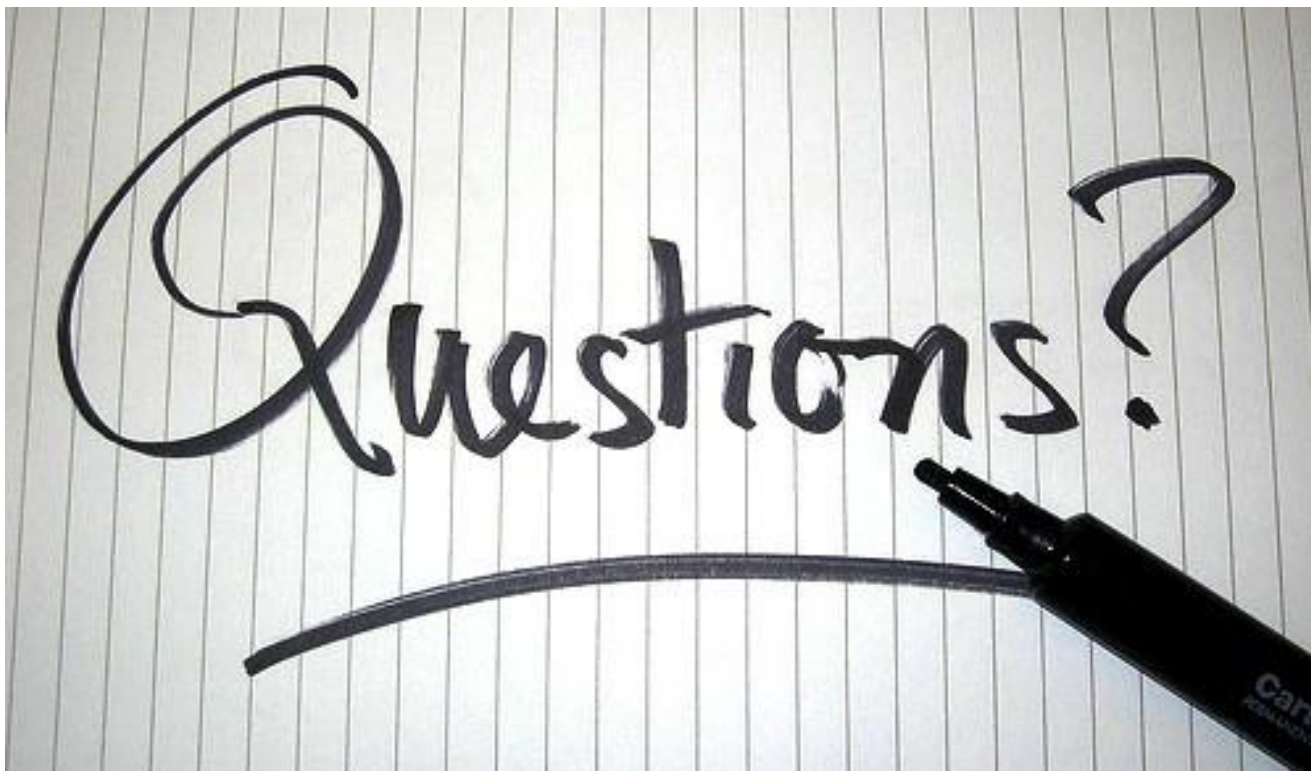
Friday May 16, 2008